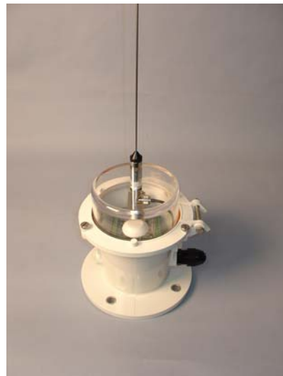
ATONIS AIS Transponder

Are you taking advantage of the new international AIS system to enhance the safety of your platform?